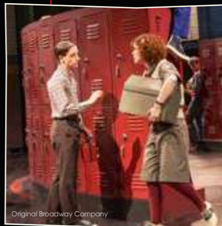
Original Broadway Company

Joyce also demonstrates a different form of courage: Her staging of Dark of the Moon is a rebellion against the restrictive confines of school under Principal Newby's leadership. Not only does she lie about staging Oklahoma! , she dares to stage a play about witchcraft in this conservative and Christian town. She is also fiercely independent, determined to obtain a scholarship, which would mean leaving Hawkins and her boyfriend.