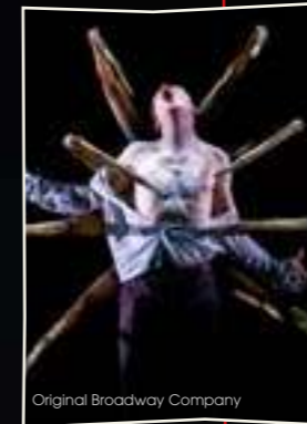
Original Broadway Company

The plot of Stranger Things: The First Shadow challenges us to consider whether some people are born "bad," or whether it is entirely external forces which make them that way. Henry's reactions when he hears of the consequences of some of his actions demonstrate that he does have moral awareness but is fighting an inner battle between good and evil forces. Some of the adults in the story behave poorly, perhaps because of their own experiences (such as experiences during World War II), but also perhaps because they are, by nature, malevolent and self-serving. Several characters make significant sacrifices to help others, but would everybody (including ourselves) have behaved in the same selfless way?