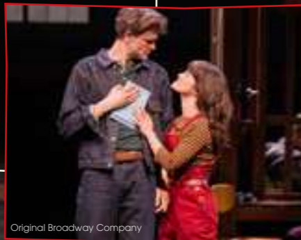
Original Broadway Company

The young people in Hawkins have to take matters into their own hands to investigate the mysterious events that the adults refuse to acknowledge. The teenagers are often wiser and more insightful than the adults who are in charge. They also call out injustices as they see them, including Patty's self-defence against Newby's criticisms, Hopper Jr.'s treatment at the hands of his father, and Joyce's demands for greater artistic freedom. They must also deal with a range of emotions, including grief, anger, fear and love.